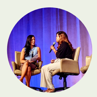
Vulnerability & Passion

Receive actionable, relatable, and pragmatic solutions to common problems that you can implement today.